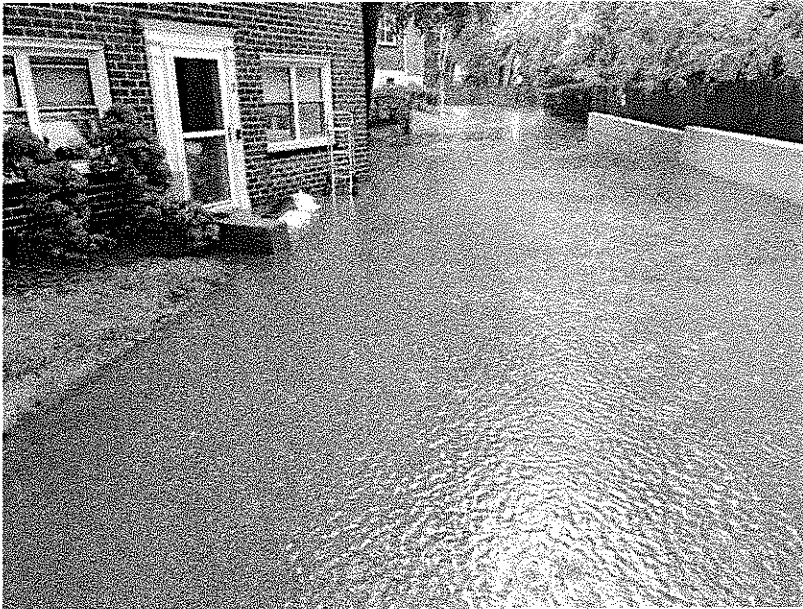
- Entrance to 2 Charter Circle from 9/29/23 rainstorm.