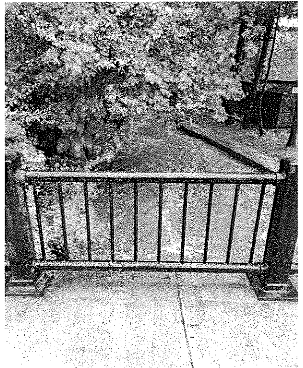
The brook between Charter Circle & South Highland Ave Ossining NY